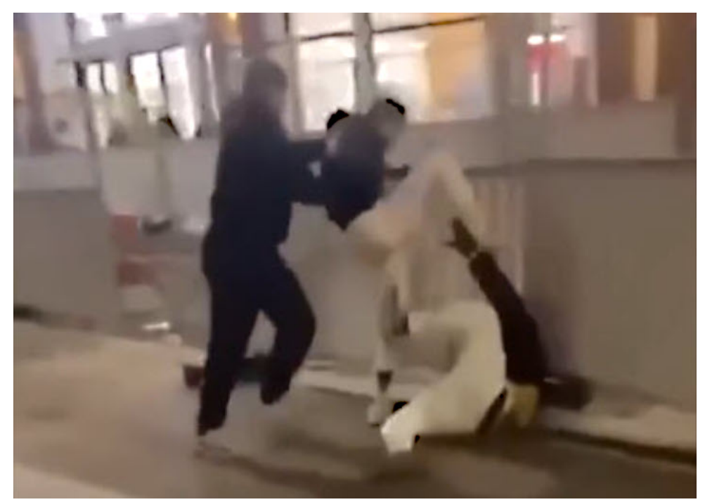
Muslim thugs brutally beat Israeli soccer fan in Amsterdam–one of numerous incidents in the November 7 pogrom against Jews. Yet, the media narrative had it as simply a brawl of soccer hooligans, downplaying antisemitism and implying Jews brought the violence upon themselves.