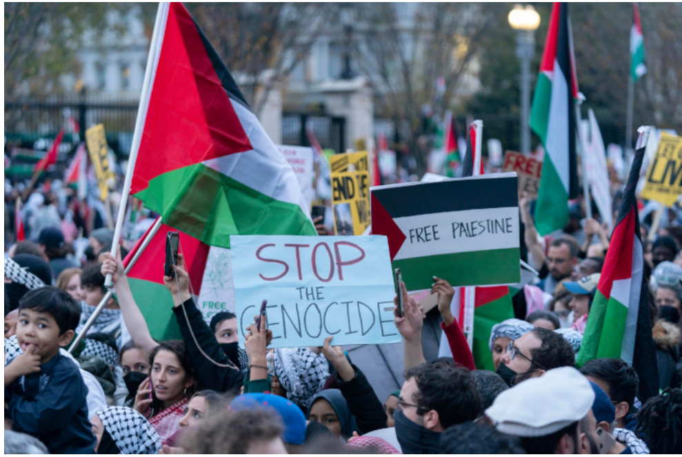
Pro-Hamas protesters slander Israel and the U.S. and scream "Allahu Akbar" in front of the White House, as well as block highways and try to shut down hospitals and airports—all part of the Information War against the Jewish state and Western values. To help Israel win this war, please read on.